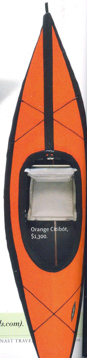
Orange Citiböt, $1,300.

Fancy a quick kayak? Going plane-to-paddle is a cinch with the sporting Citiböt, a full-size DIY boat that weighs just 24 pounds and folds into a backpack. White water, here we come!